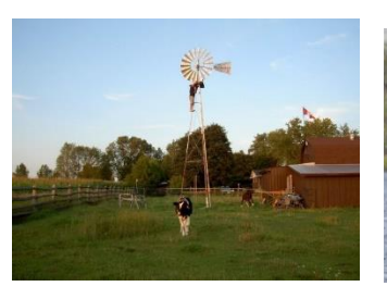
Mount Albert Agricultural History